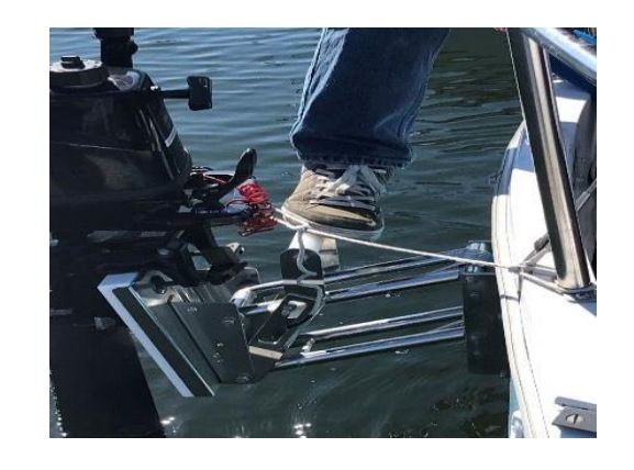
TIP: Use your foot on the white handle to push the lever down, and then again to release it.

Using the white handle on the motor bracket, lower the motor until the rod lines up with the green tape.